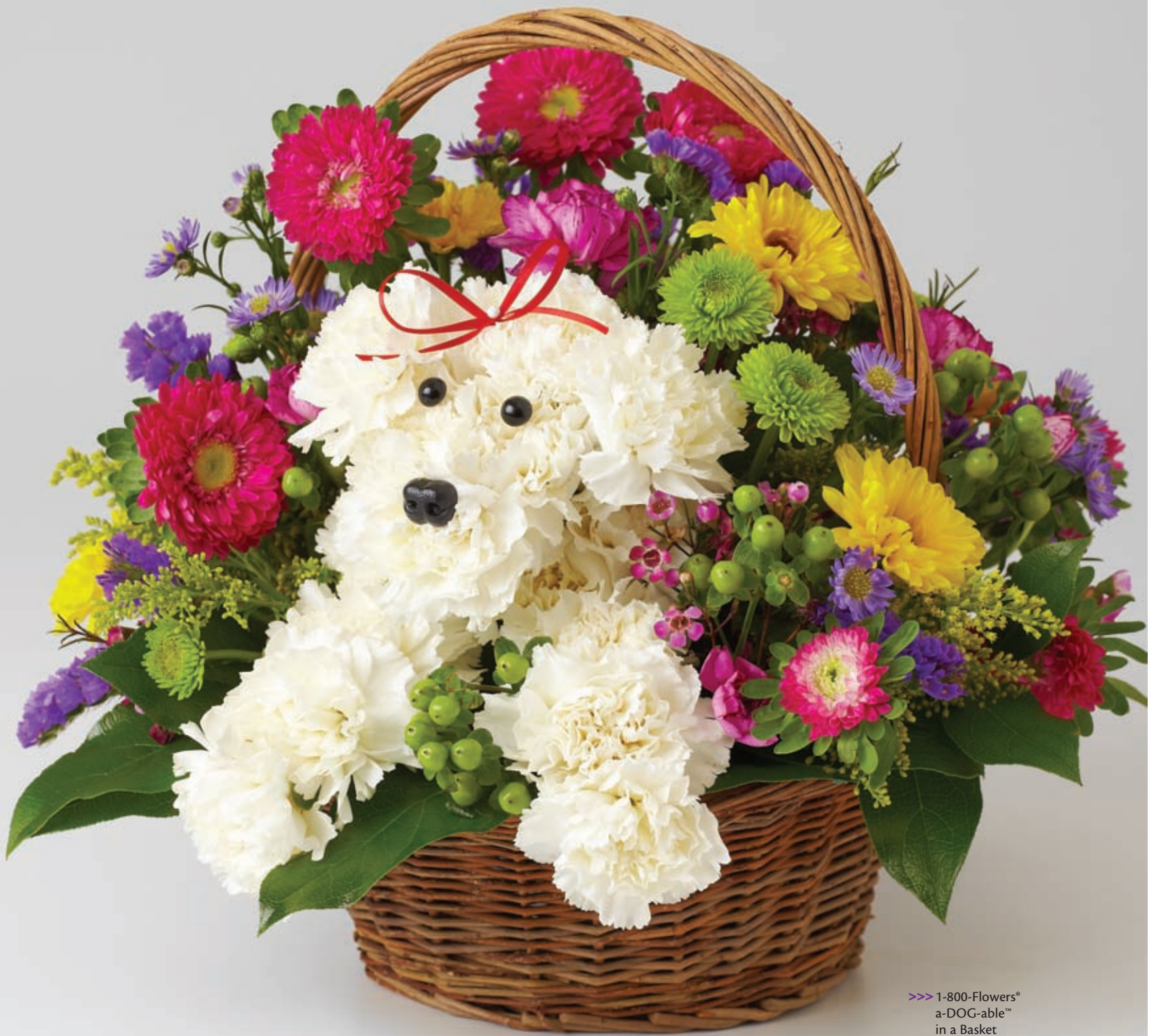
>>> 1-800-Flowers® a-DOG-able™ in a Basket